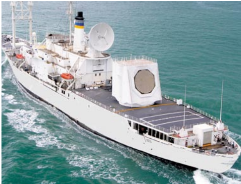
The Cobra Judy S-Band radar is located on the aft section of the USNS Observation Island. Working in conjunction with its sister X-Band radar, it is operated by the U.S. Air Force and deployed worldwide.

Cobra Judy S-band is a phased-array data collection radar mounted aboard the USNS Observation Island. Designed in 1976 and first made operational in 1981, the transmitter hardware became difficult to support, with some components entirely obsolete. In December 2004, DTI began the effort to modernize the transmitter by installing modern, solid-state technology. All of the transmitter's electronic systems between ship's power and the radar's sixteen Traveling Wave Tubes (TWTs), their solenoids, the solenoid power supplies and ion pump controllers, were upgraded. Installation was completed in October 2006.