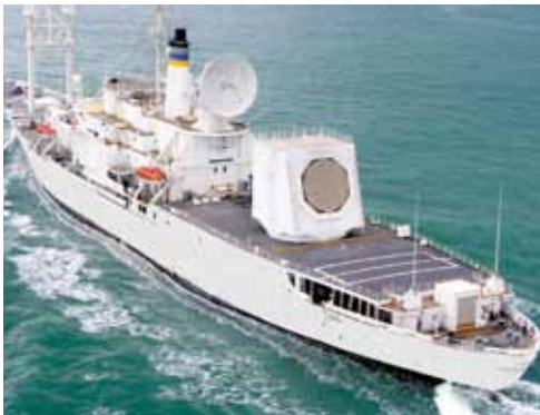
The Cobra Judy S-Band radar is located on the aft section of the USNS Observation Island. Working in conjunction with its sister X-Band radar, it is operated by the U.S. Air Force and deployed worldwide.

Cobra Judy S-band is a phased-array data collection radar mounted aboard the USNS Observation Island. Designed in 1976 and first made operational in 1981, the transmitter hardware became difficult to support, with some components entirely obsolete. In December 2004, DTI began the effort to modernize the transmitter by installing modern, solid-state technology. All of the transmitter's electronic systems between ship's power and the radar's sixteen Traveling Wave Tubes (TWTs), their solenoids, the solenoid power supplies and ion pump controllers, were upgraded. Installation was completed in October 2006.