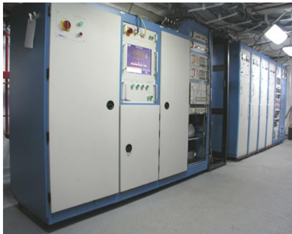
New Cobra Judy X-band transmitter electronics. Power distribution unit and transmitter interface unit (foreground), and three, 50 kV, 2 A power supplies and combiner (right).

These pulses from the new Cobra Judy X-band transmitter show the fast rise and fall times and nearly ideal flat tops resulting from precise voltage control.