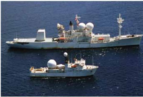
USNS Observation Island (top) and USNS Invincible.

The Cobra Judy X-band radar is in the Observation Island. DTI also replaced a vacuum tube crowbar system in the Invincible's X-band radar with a solid-state opening switch.