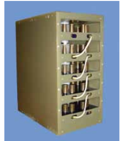
This 45 kV, 50 A solid-state opening switch replaced the vacuum tube crowbar on the Invincible's GrayStar X-band radar.