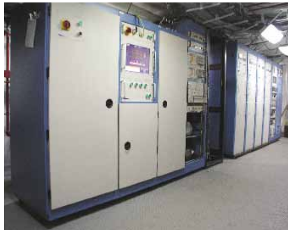
New Cobra Judy X-band transmitter electronics. Power distribution unit and transmitter interface unit (foreground), and three, 50 kV, 2 A power supplies and combiner (right).

These pulses from the new Cobra Judy X-band transmitter show the fast rise and fall times and nearly ideal flat tops resulting from precise voltage control.