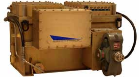
DTI 1 MW C-band direct-switched magnetron modulator. Size is approximately 35½”l x 26”w x 21”h. The unit mounts directly to an antenna mount. Approximate weight 537 lbs. with oil.

DTI’s expertise in magnetron transmitter design and construction is readily applied to custom transmitter requirements and upgrades of existing transmitters