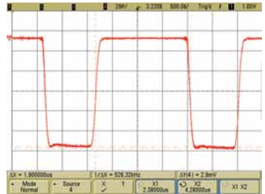
C-band modulator operation. Detected RF at 38 kV cathode, 56 A, 630 Hz. Nominal 1 μs wide double pulses spaced at 1.9 μs.