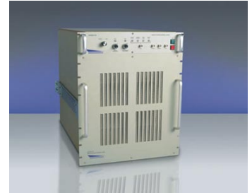
PowerMod 20-150 3 MW, 30 kHz solid-state modulator. Size 19" w x 30" d x 24" h rack-mount. Forced air cooled.

PowerMod modulators are available in a wide range of voltage, current, and performance configurations.