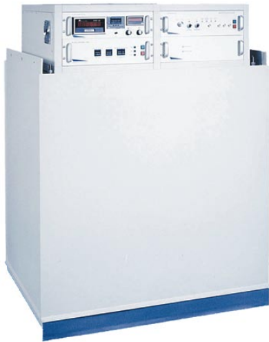
PowerMod 100-150 solid-state modulator, 100 kV, 100 A. Size 50" w x 36" d x 64" h. Oil and water cooled.

DTI's PowerMod modulators deliver the breakthrough advantages of solid-state high power switching to demanding pulsed power applications world-wide.