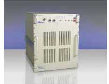
PowerMod 20-150 3 MW, 30 kHz solid-state modulator. Size 19" w x 30" d x 24" h rack-mount. Forced air cooled.

PowerMod modulators are available in a wide range of voltage, current, and performance configurations.