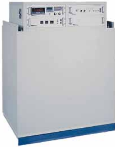
PowerMod 100-150 solid-state modulator, 100 kV, 100 A. Size 50" w x 36" d x 64" h. Oil and water cooled.

DTI's PowerMod modulators deliver the breakthrough advantages of solid-state high power switching to demanding pulsed power applications world-wide.