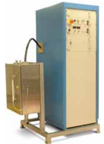
PEF pilot plant with a capacity of up to 400 liters/hour. The power supply, modulator, and controls are in the cabinet on the right. Treatment chambers are in the enclosure on the left.

*Source: OpenCELL, LLC. website. www.opencel.com