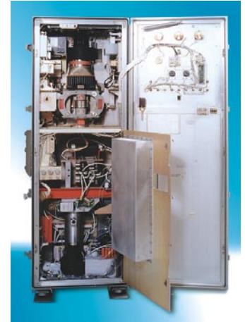
AN/SPG-60 radar transmitter enclosure with DTI modulator retrofitted in lower compartment.

DTI has successfully modernized many other radar systems with reliable solid-state electronics.