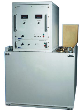
AN/FPQ-17 MIR switching power supply and opening switch.