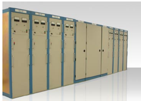
Cobra Judy S-band transmitter power supplies.

A transmitter upgrade using modern, solid state technology, may be the most cost-effective answer to problems of high failure rates and lengthy repair procedures common to transmitters using vacuum switch tubes. A retrofit may encompass a few components or a complete subsystem. In most cases, the modernization is accomplished within the existing structural envelope, whether a typical shipboard cabinet or a transportable shelter. DTI can provide the upgrades as fully MIL-Qualified, field-installable kits ready for installation into ship-mounted cabinets, or in new enclosures.