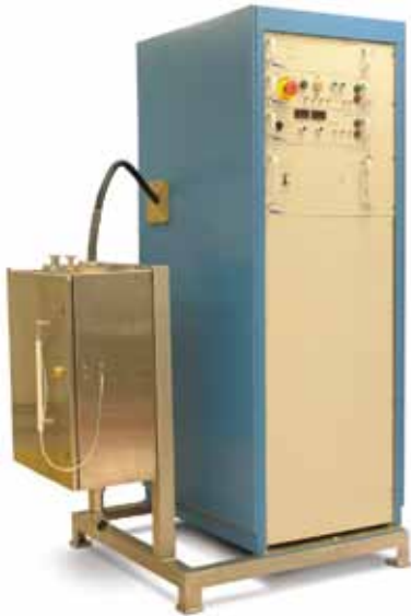
25 kW PEF treatment system. The enclosure containing the PEF treatment chamber is shown on the left. The tall cabinet contains the pulse modulator, controls, and high voltage power supply.

Pulsed Electric Field (PEF) processing passes liquid foods or other pumpable products through a treatment chamber, where the product is subjected to short (1 \mu s – 20 \mu s) pulses of very high voltage. The high voltage field created across the liquid (approximately 35-50 kV/cm) kills microorganisms via electroporation, the rupturing of the organism's cell membrane. Typically, multiple treatment chambers apply pulses to a stream of fluid, achieving kill ratios of 5-9 log, similar to those of pasteurization. Experiments have demonstrated that the shelf life of PEF processed food is comparable to that of pasteurization, with no adverse impact on the taste or nutritional value of the food. The same system, operating at lower electric field strength, can be used to make plant and meat tissues permeable to support extraction, drying, and other processes.