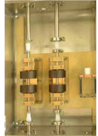
The PEF treatment enclosure contains two, separate dual-chamber PEF treatment assemblies. The chambers are manufactured under an exclusive license from The Ohio State University Research Foundation.

DTI's Pilot-Plant PEF Processing system represents an optimized approach to PEF processing research, process development, and small-scale commercial installations. Please contact us for more information and an initial assessment of your requirements.