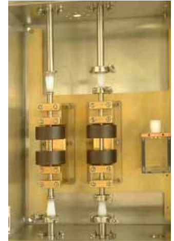
The PEF treatment enclosure contains two, separate dual-chamber PEF treatment assemblies. The chambers are manufactured under an exclusive license from The Ohio State University Research Foundation.

DTI's Pilot-Plant PEF Processing system represents an optimized approach to PEF processing research, process development, and small-scale commercial installations. Please contact us for more information and an initial assessment of your requirements.