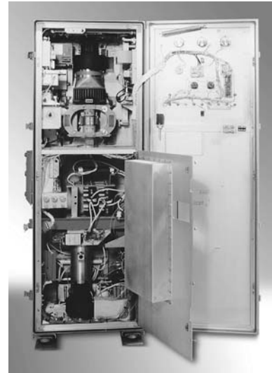
Figure 3. AN/SPG-60 radar cabinet. DTI's upgrade kit is installed in the lower compartment.

In summary, combining VED RF amplifiers and solid-state modulators and power supplies is a proven means to build highly reliable high power transmitters. It is possible that the reliability of a solid-state VED transmitter may be limited solely by cathode depletion.